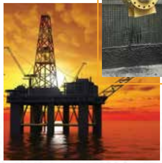
Petroleum, Oil & Gas