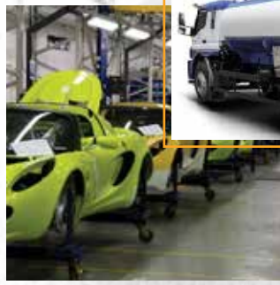
Automobile & Transportation