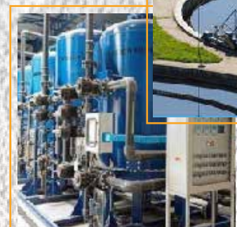
Water Purification & Wastewater Treatment