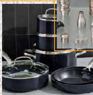
Home Appliances & Precision Parts