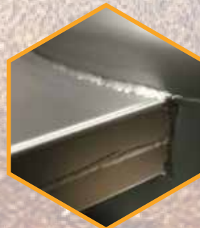
Pickling & Passivation