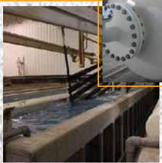
Manufacturing & Heavy Engineering